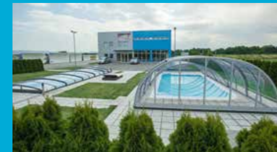
Branch in Bad Fischau

Polyfaser S.p.A. Via Pineta, 99 I-39026 Prato allo Stelvio (BZ) T. +39 0473 616 180 info@polyfaser.it