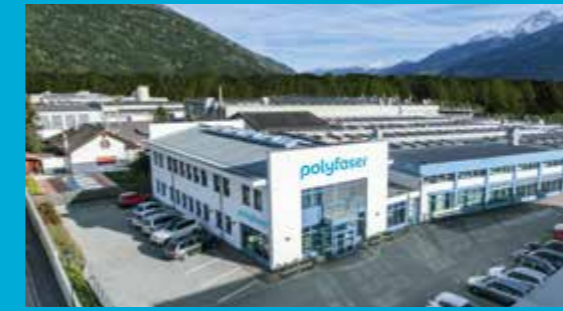
Headquarters and factory in Prato allo Stelvio