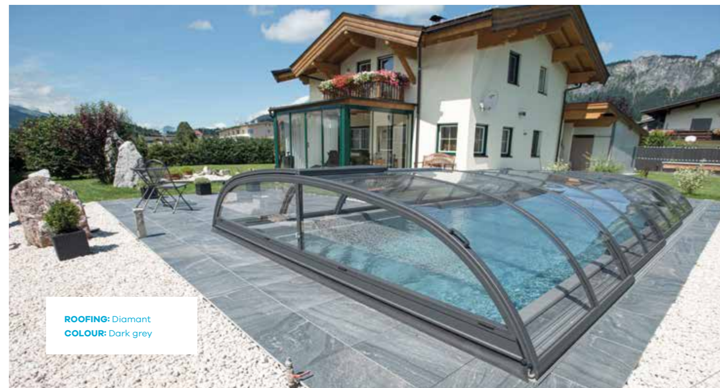
ROOFING: Diamant COLOUR: Dark grey