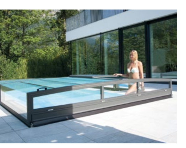
ROOF: Opal COLOUR: Dark grey